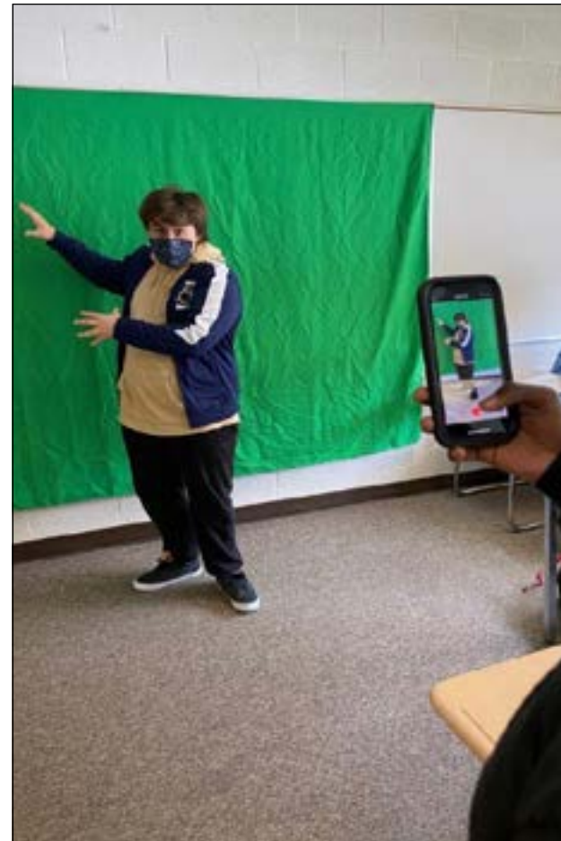
The Digital Media program is designed to educate students with hands-on experience.